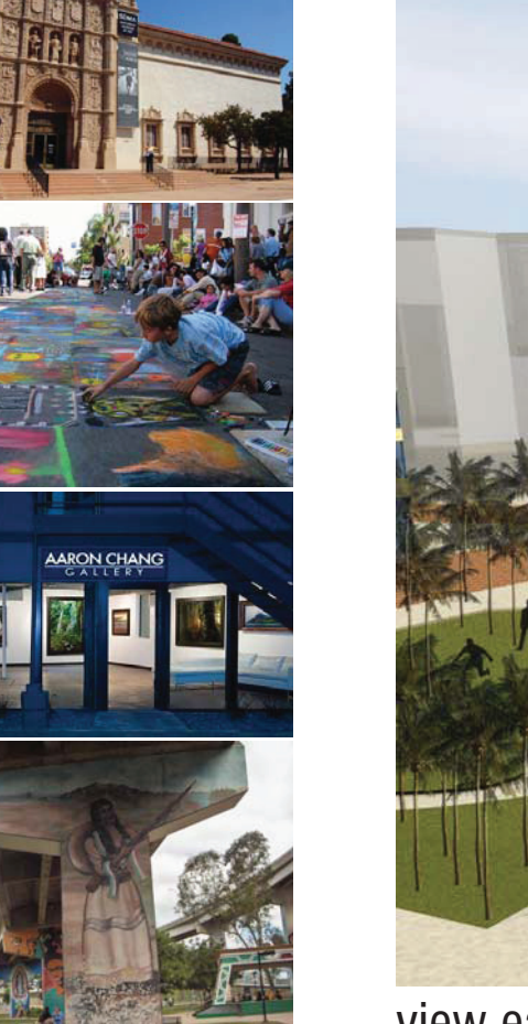
view east toward Art Galleria