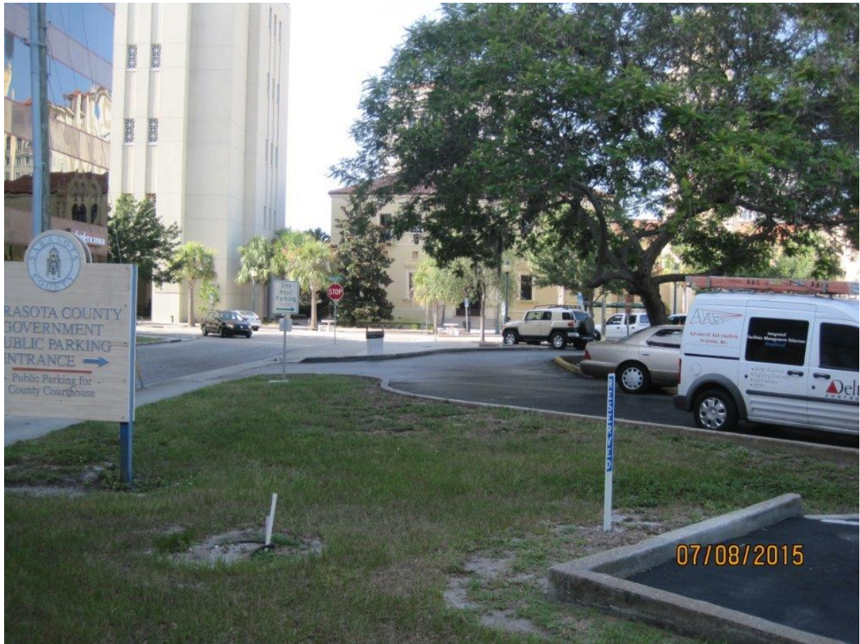
View from the northeast corner of the property looking directly south to the Historic Courthouse