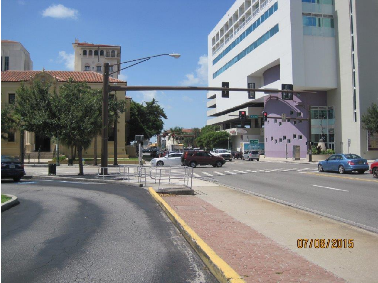
View from the west side of property looking to the south and at the intersection of North Washington Boulevard and Main Street