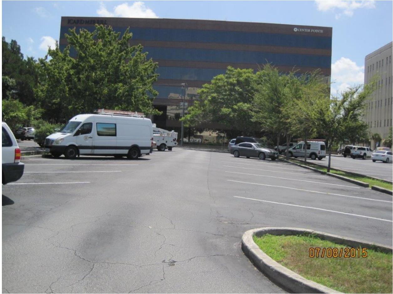
View from the west side of the property looking east