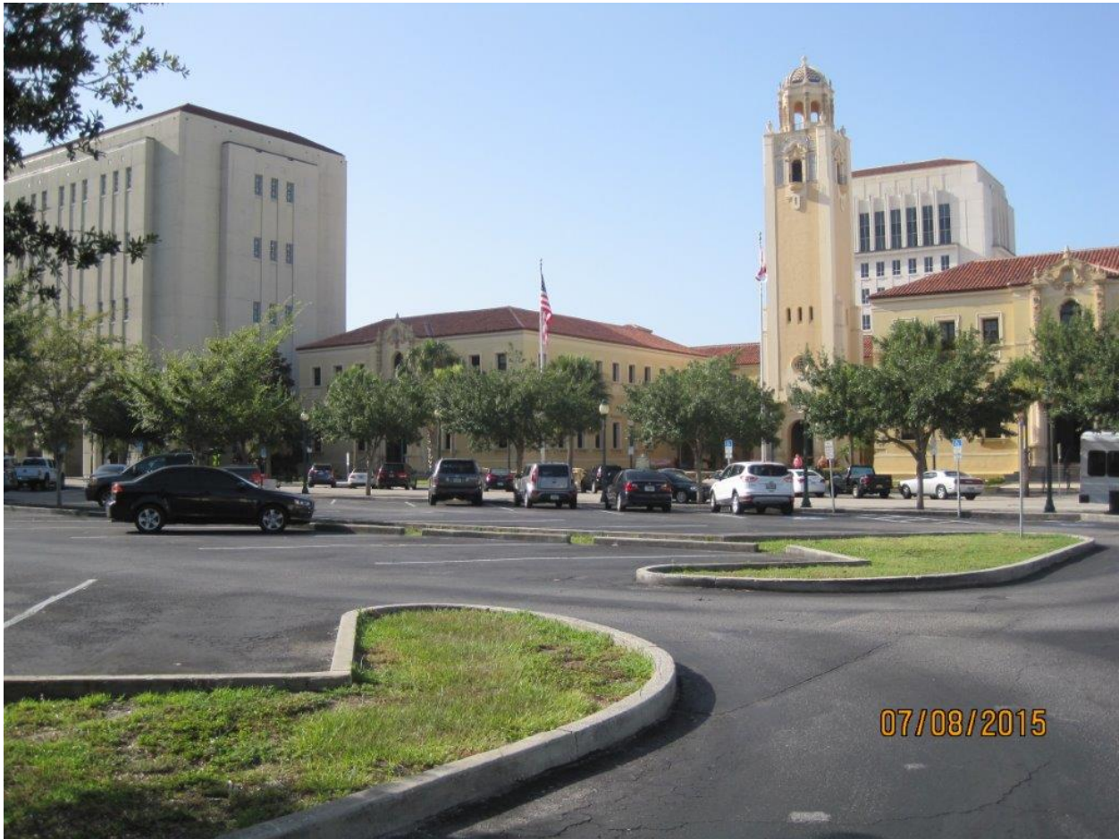
20 N. Washington- view from west side of the surface parking lot looking south