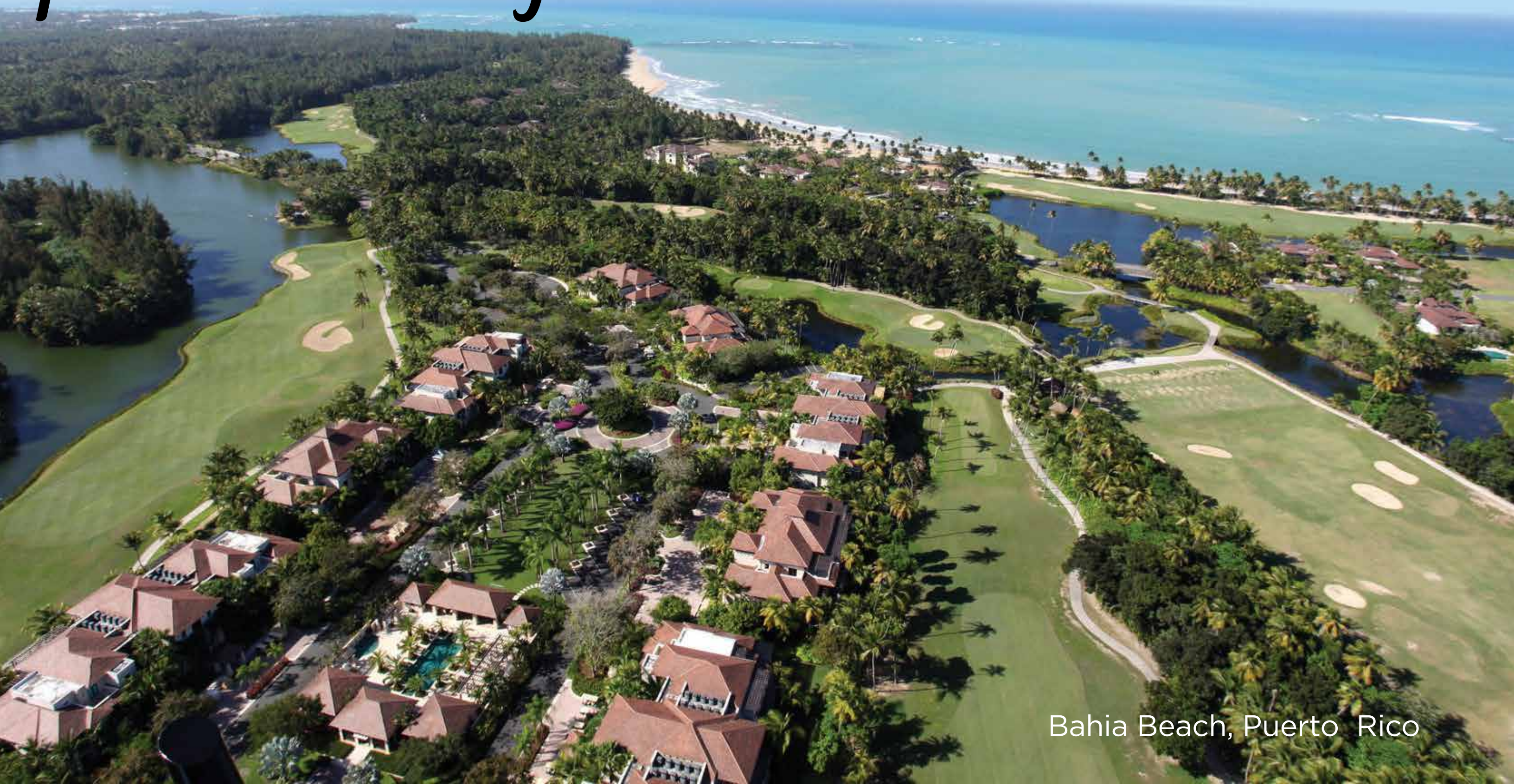
Bahia Beach, Puerto Rico

enhance the offerings with product diversification