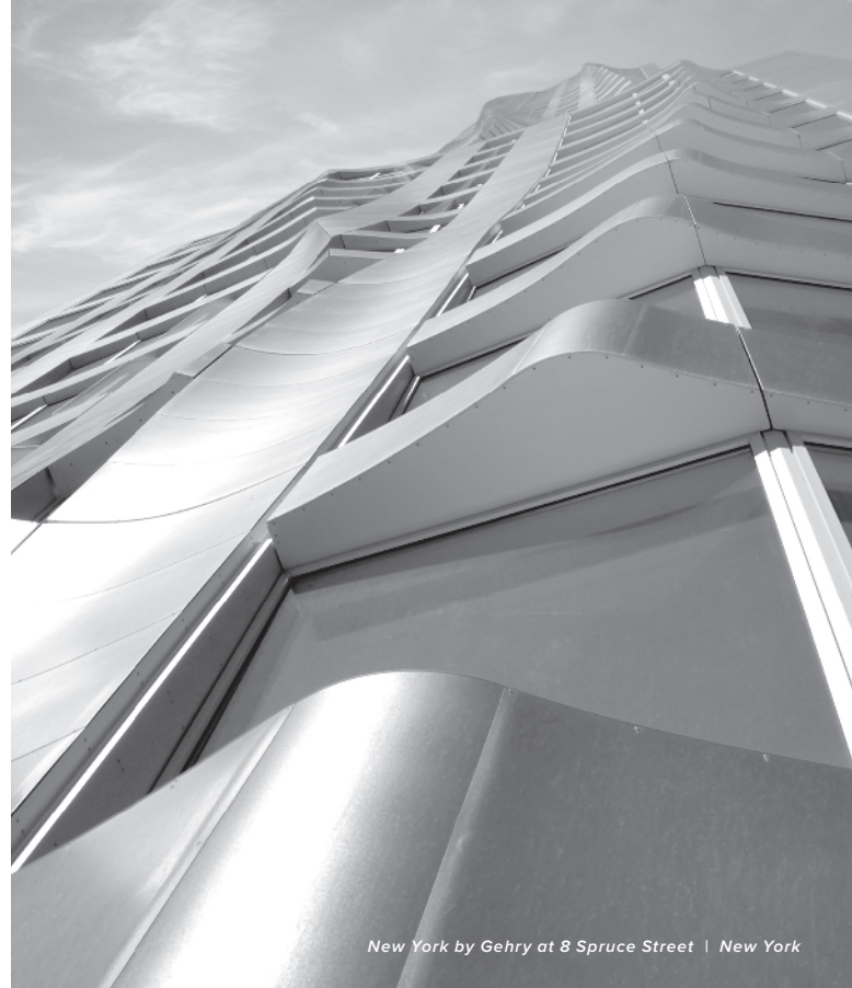
New York by Gehry at 8 Spruce Street | New York

Join us on Tuesday, October 6, on Level 2 of Moscone West for a new networking event! The ULI Developers Showcase will feature project poster displays, and project representatives will be there to answer your questions. This is a unique opportunity for you to informally exchange information, hear lessons learned and best practices as you browse these graphic representations of development projects. Each project poster will be displayed for one hour. Check the ULI Events App or the onsite posted schedule for projects, presenters, and times.