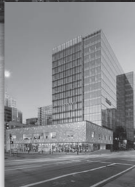
680 & 690 Folsom 50 Hawthorne