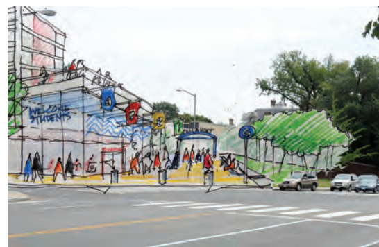
The corner of Florida Avenue and Sixth Street will be the location of the new main entrance to the campus.