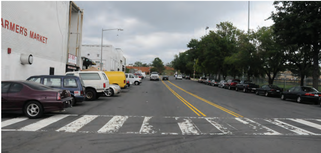
Sixth Street currently acts as the “back side” of campus and responds to excessive right-of-way that serves the Market. Humanizing this road will improve the connections and synergies between the Market and the university.

serves the Market. There is nothing at the corner of Florida Avenue and Sixth Street announcing that a historic campus is located just behind it. Like Florida Avenue, Sixth Street is hostile to pedestrians and there are no safe crossings into the campus. If any street deserves to be put on a road diet, it is Sixth Street.