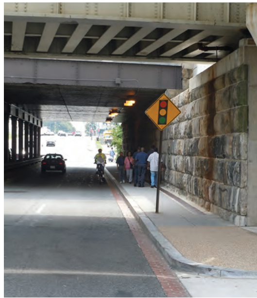
The New York Avenue/Florida Avenue/Gallaudet University Metro station is an important component in connecting the university with the rest of the city. It also can be an important factor for businesses looking to locate adjacent to the university. The current access to the Metro along Florida Avenue needs to be improved.